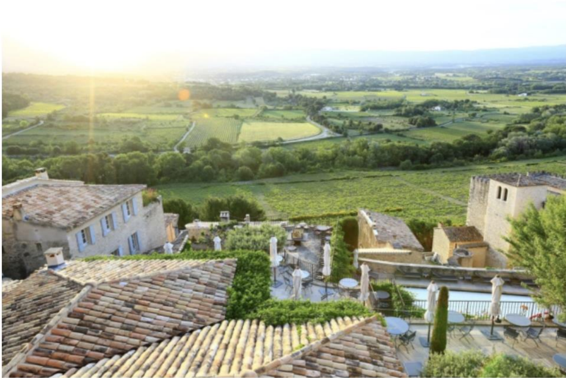
Hôtel Crillon le Brave in the heart of Vaucluse