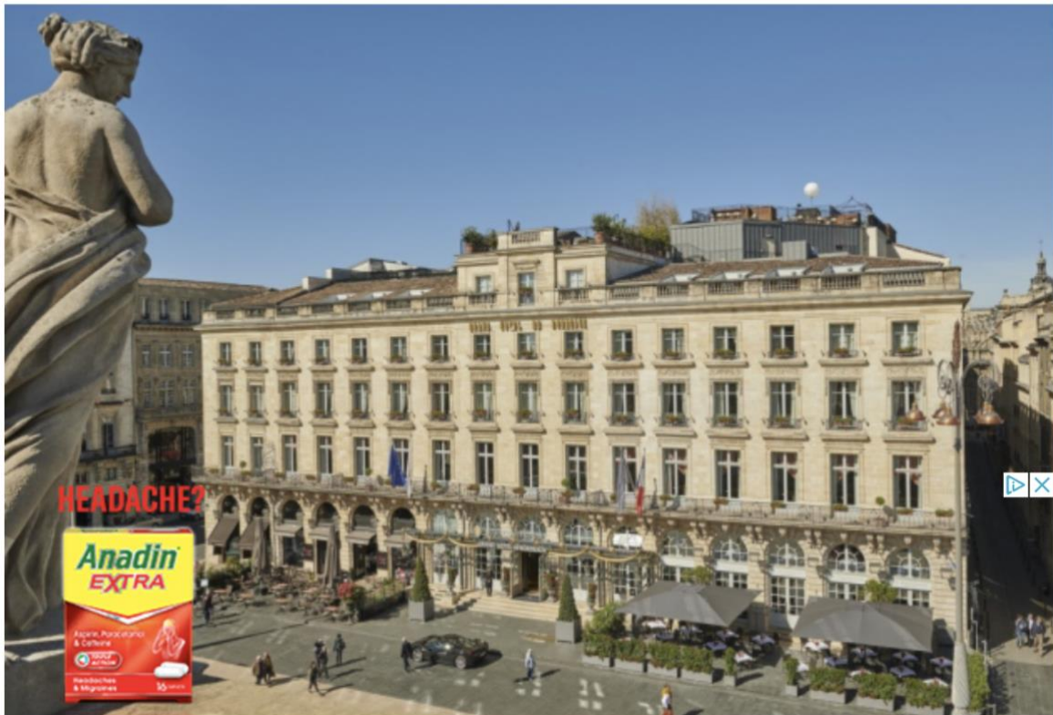
InterContinental Bordeaux - Le Grand Hotel

France's leading hotels, resorts and tour operators have been crowned following a year's search for the world's top travel and tourism destinations.