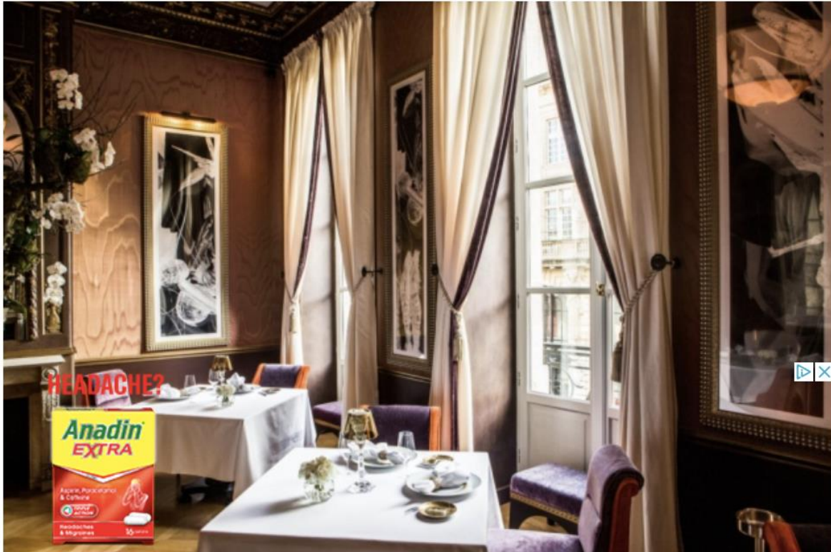
The opulent décor at Le Pressoir d'Argent Gordon Ramsay