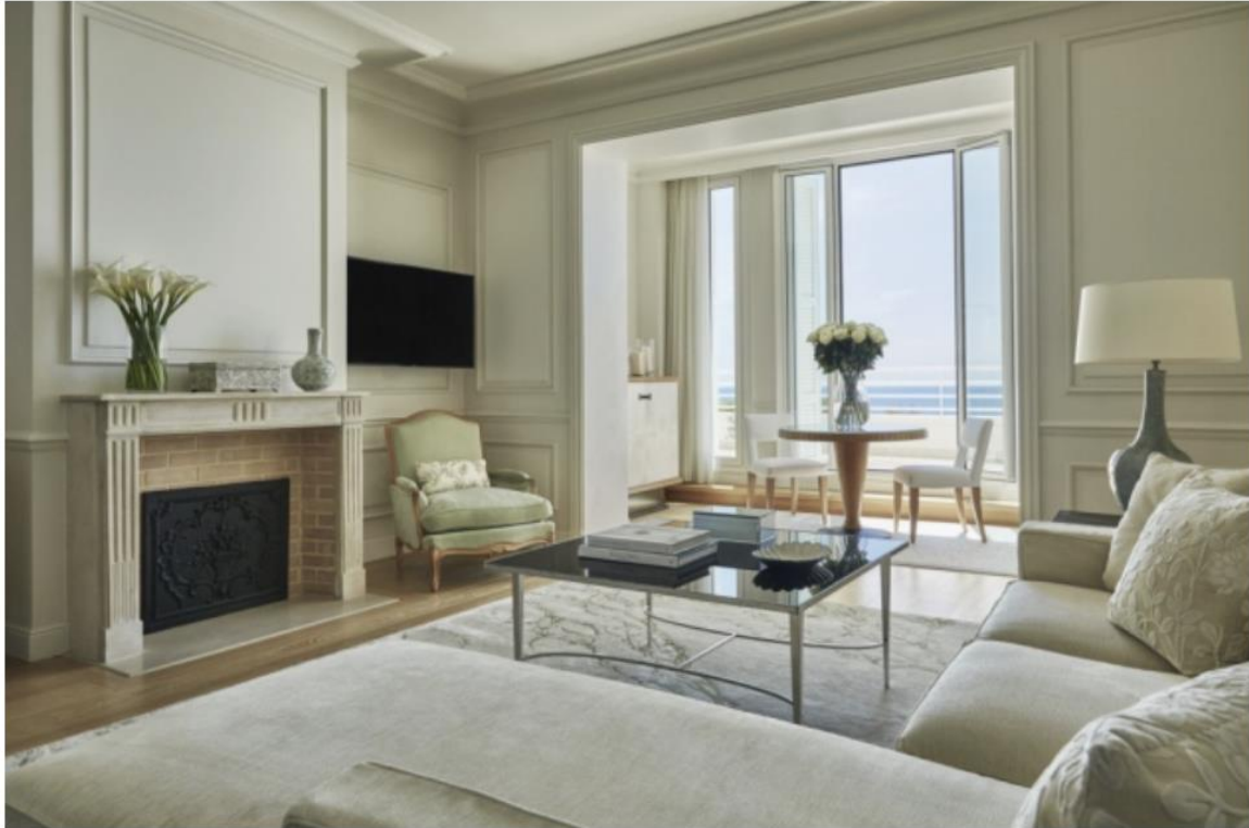
A Palace Sea-View suite at Grand-Hôtel du Cap-Ferrat with windows looking out onto the Mediterranean