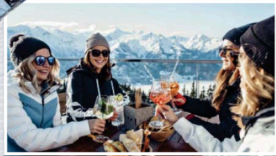
HIGH LIFE: Cocktails at Zell am See. Top left: A busy skilift at Pila in Italy

E UROPE, according to the best estimates, has 3,962 ski resorts with 24,000 miles of slopes and no fewer than 16,743 ski lifts. Add in some 523 American resorts and 297 in Canada and that's an awful lot of resorts to choose from – and plenty of pistes, too.