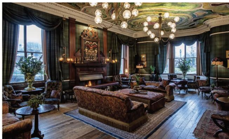
The Fife Arms drawing room, with the eponymous tartan and ceiling artwork by Zhang Enli

Past, present and future. For the past, enjoy the storied history of the hotel itself and admire the local area. The front desk can organise a trip with Braemar Highland Experience, which can teach you everything from the