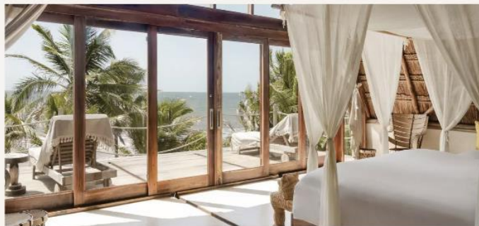
At La Valise, the Caribbean waters of the Riviera Maya are just moments away

Spend your days lounging under the Mexican sun on squishy daybeds and tasselled hammocks, listening to the tinkling sounds of the numerous water features and surrounding bird life. Sarah Freeman From £503 per night, including breakfast (00 13 05 999 1540; www.lavalisetulum.com )