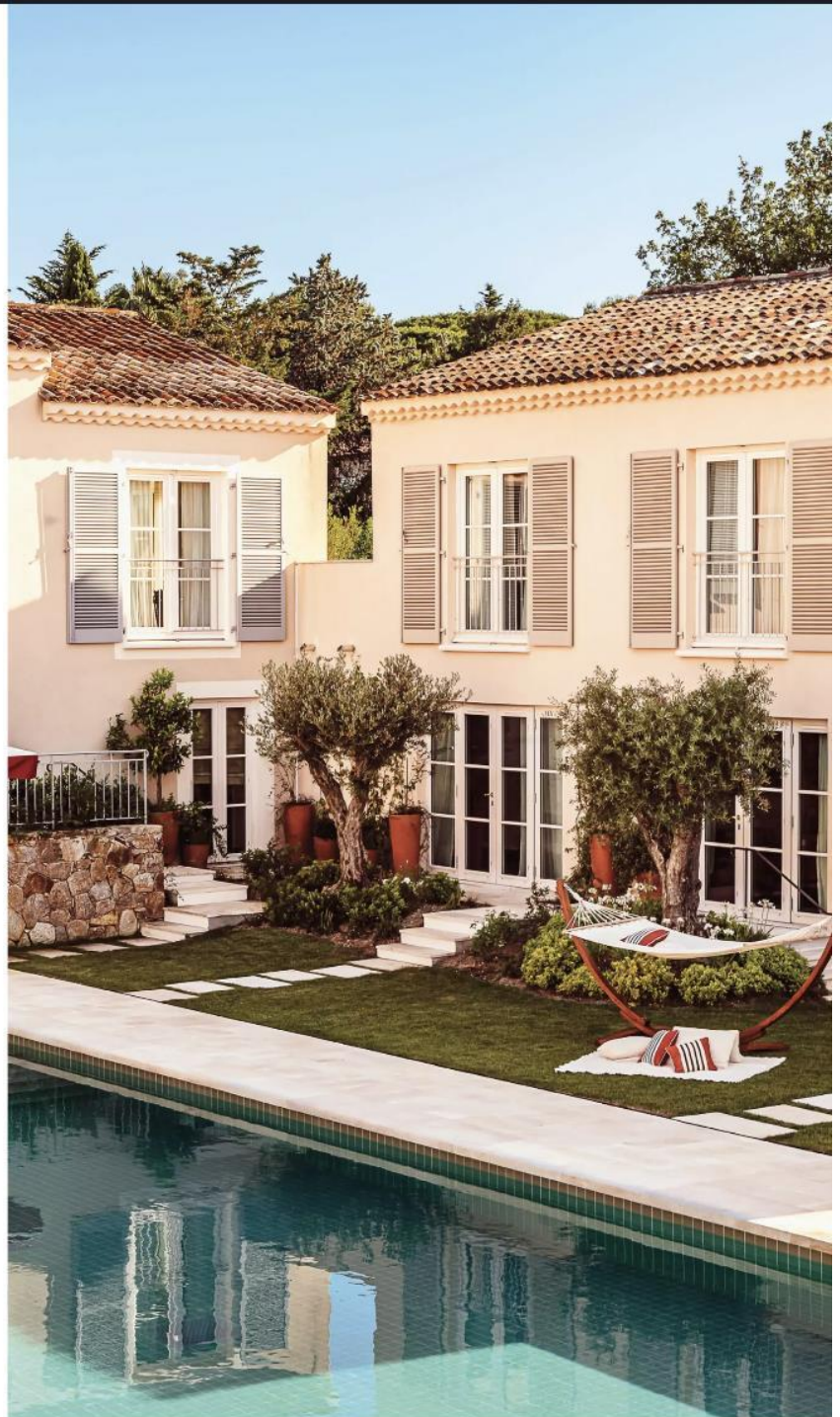
Time to relax: guests are often found lazing around Lou Pinet's sea-green tiled pool

So, what to pack? A headscarf would be a good start, because Lou Pinet oozes 1960s style. The bold colour palette—coral reds, ochre yellows, navy and flashes of bright blue—is the brainchild of interior designer Charles Zana. Many of the beds sport retro-print headboards; tactile, rough-woven rugs carpet the terracotta-tiled bedroom floors; crescent-shaped sofas pop up in both the private and communal areas. The bathrooms err on the right side of bohemian and it's hard not to fawn over the airy indoor