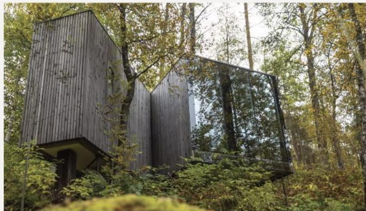
Jensen & Skodvin designed the contemporary bedrooms at the Juvet Landscape Hotel