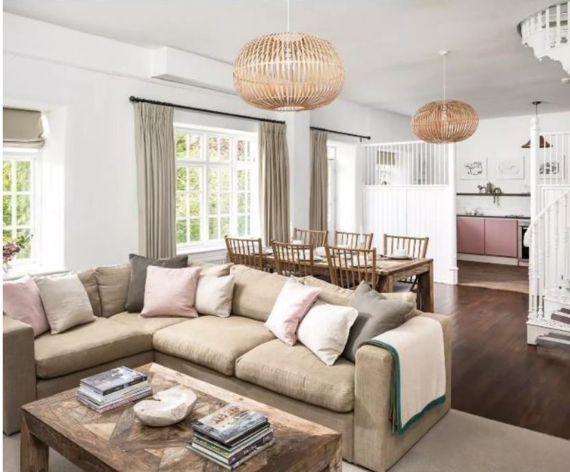
Pretty and practical: Valency Wood is 'exactly what you want' for a Cornwall staycation